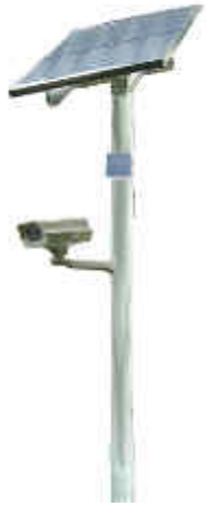
ANALOG CAMERA WITH SOLAR POWER AND 2.4 GHz RADIO