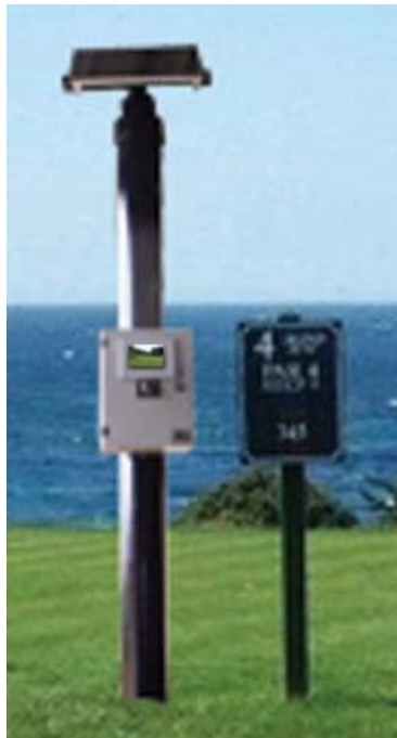
SOLAR POWERED LCD MONITOR RECEIVER